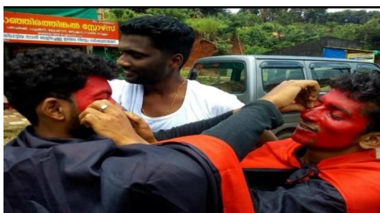
Street Play at Thopramkudy and Cheruthoni, 09.09.2019