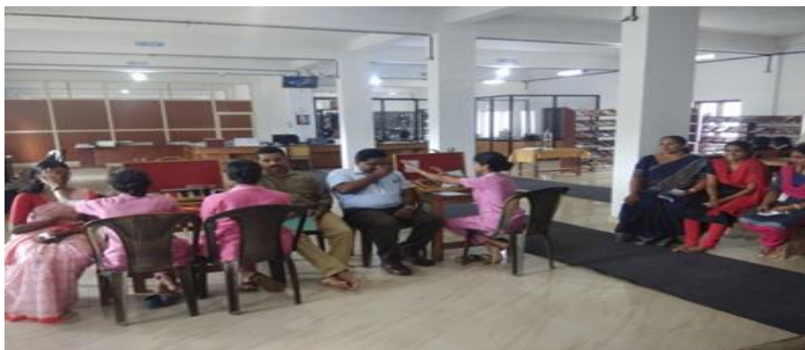
Eye Testing Camp, 08.07.2019