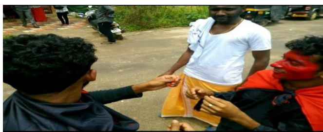
Street Play at Chelachuvadu, 14.09.2019