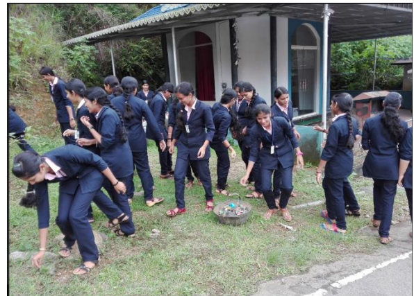
Public road cleaning, 05.06.2019