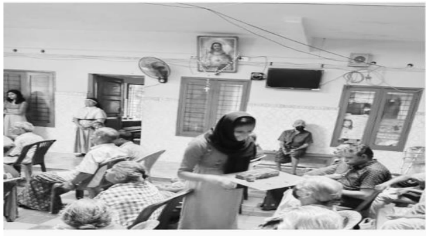
Snehabhavan visit, 07.06.2019

On June 7, 2019, the Department of Malayalam at Pavanatma College organized a Palliative Care Visit to Snehabhavan. The primary objective of this extension activity was to provide BA Malayalam students with a practical experience of palliative care, enabling them to witness the compassionate care provided to individuals with serious illnesses. Students gained a practical understanding of palliative care and its importance in improving the quality of life for patients with serious illnesses. Interactions with patients and healthcare providers deepened students' empathy towards those facing life-limiting conditions, highlighting the significance of emotional support. Students had the opportunity to engage with healthcare professionals, asking questions and gaining insights into the field of palliative care. Many students expressed enthusiasm for volunteering opportunities in palliative care organizations, indicating a desire to contribute to their community.